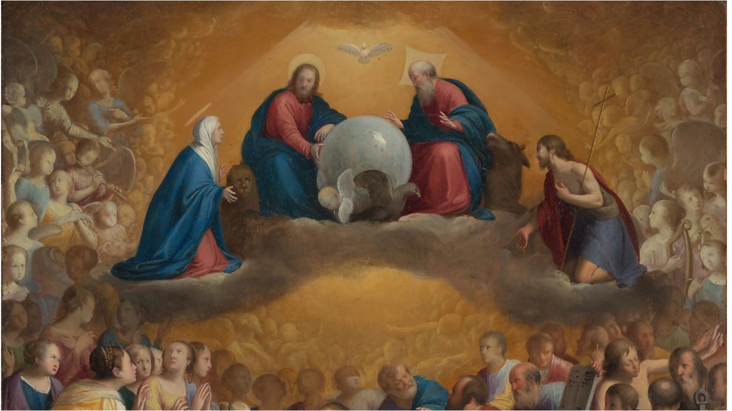
PARADISECA, CARLO SARACENI, 1598