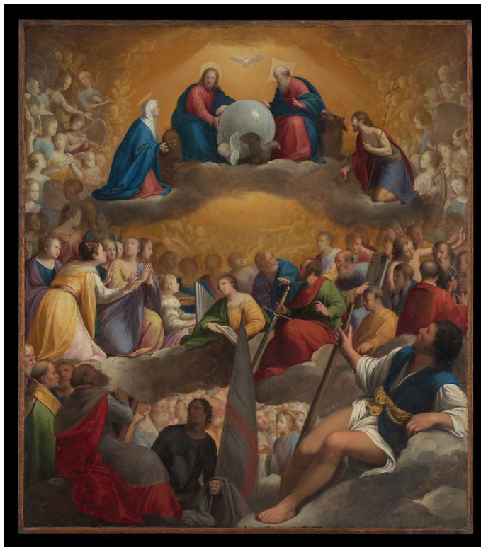
PARADISE CARLO SARACENI, 1598