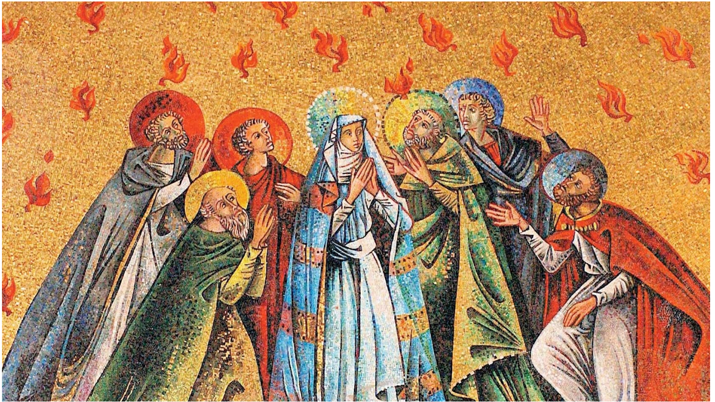
SANCTIFICATION DOME MOSAIC, MAX INGRAND, 1968 BASILICA OF THE NATIONAL SHRINE OF THE IMMACULATE CONCEPTION, WASHINGTON, D.C.