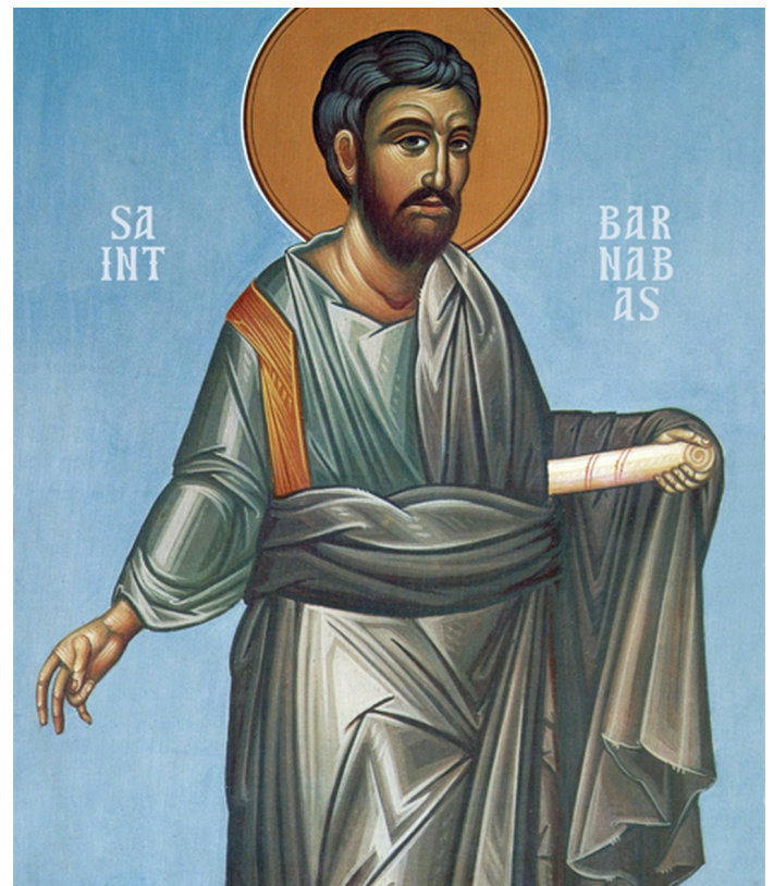
ICON OF SAINT BARNABAS

Barnabas, a Jew of Cyprus, comes as close as anyone outside the Twelve to being a full-fledged apostle. He introduced Paul to Peter and the other apostles and traveled and preached with him extensively. When a Christian community developed at Antioch, Barnabas was sent as the official representative of the church of Jerusalem to incorporate them into the fold. But all was not peaceful. When Paul wanted to revisit the places they had evangelized, Barnabas wanted to take along his cousin John Mark, author of the Gospel, but Paul insisted that he was not fit to take along now. The disagreement that followed separated Barnabas and Paul: Barnabas taking Mark to Cyprus, Paul taking Silas to Syria. Later they were reconciled. Barnabas is spoken of simply as one who dedicated his life to the Lord. He was a man "filled with the Holy Spirit and faith. Thereby, large numbers were added to the Lord." Even when he and Paul were expelled from Antioch in Pisidia—modern-day Turkey—they were "filled with joy and the Holy Spirit."