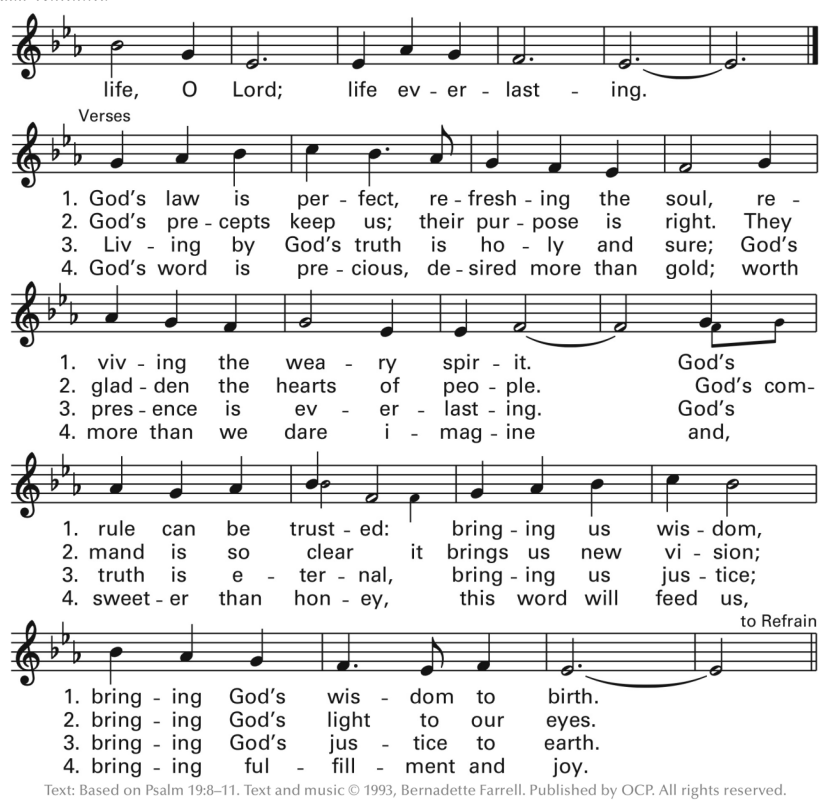
Second Reading: 1 Corinthians 12:12-30